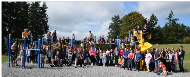
Terry Fox Run Photo

It is with great excitement that we have welcomed in October. We closed off the month of September with our Orange Shirt Day, Terry Fox Run and family BBQ. We had beautiful weather for our Terry Fox Run and it was wonderful celebrating this special day with so many of our students and families