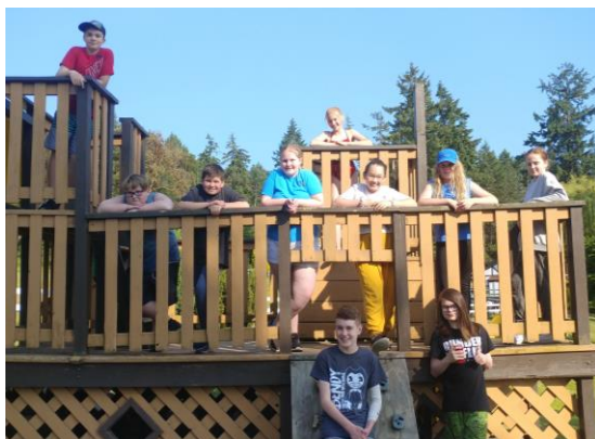
A group of our Grade 6/7 students celebrating school year-end at Capernwray.

It has been another outstanding year of learning at Island ConnectEd. We are down to the final weeks of the 2018-2019 school year. As always, we have been impressed by the successes of so many of our talented and hard-working students.