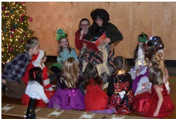
(A scene from the Winter Pageant.)